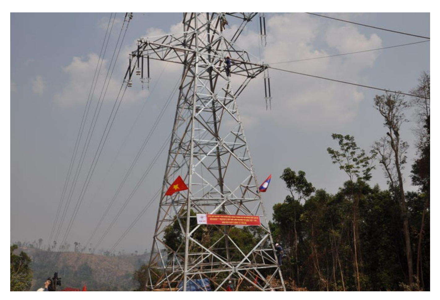
A part of the 220 kV power line connecting Laos and Vietnam in Gia Lai province, Vietnam's Central Highlands.

Along with state utility Vietnam Electricity (EVN), the ministry will process the signing of a power purchase agreement (PPA) and complete other procedures; as also ensure the project's economic efficiency.